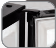
Reversible reinforced door hinges