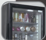
Glass door (optional)