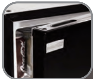
Integrated door opening holder