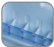
Adjustable door shelves

The Onity hospitality solutions range incorporates a series of user-friendly and silent minibars.